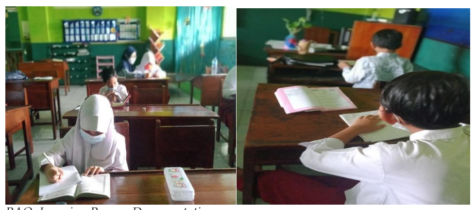
PAQ Learning Process Documentation

In the implementation of PAQ, all parties have tried to the maximum, both from the principal. PAQ supervisors and also the teacher council to provide the best for students. However, PAQ learning cannot only be carried out in schools or during PAQ lessons.